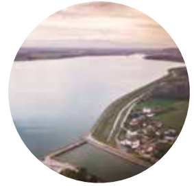
PTUJ LAKE 5 km