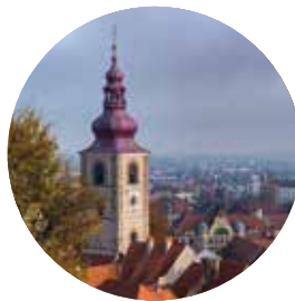
CITY TOWER 100 m