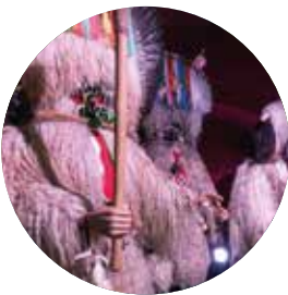
KURENT HOUSE 100 m